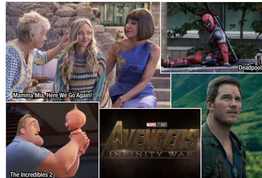
Mamma Mia! Here We Go Again!

The next generation of super models is getting two very welcome new additions. Kaia Gerber is the 16 year old offspring of famed supermodel Cindy Crawford. Not only has she inherited her mother's beauty, but her charm and professionalism as well, making her the perfect choice for iconic brands, like Versace and Alexander Wang. As for Duckie Thot, this new model first came to be known through Australia's Next Top Model. She has been featured in Fenty Beauty's campaign, as well as on the runway of Dsquared2. Her star power is sure to get even brighter this year.