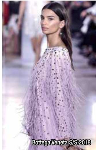
Bottega Veneta S/S 2018

Fringes were all the rage in the S/S 2018 runway shows; most recently, a lot of celebrities have rocked the look, such as Daisy Ridley and Kendall Jenner. Due to the trend's versatility, it is much loved among the A-listers in Hollywood and already high street stores are following with fringe jackets and dresses.