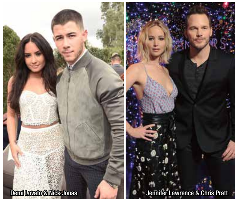
Demi Lovato & Nick Jonas

For Positive Luxury's Full 2018 Predictions Report, visit: www.positiveluxury.com/about/intelligence