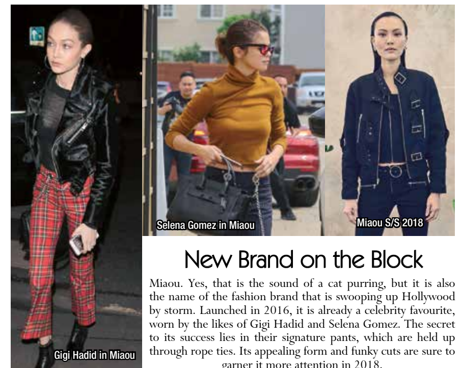
Selena Gomez in Miaou

The upcoming standalone Star Wars movie, Solo: A Star Wars Story , is making a debut this year. The movie stars Alden Ehrenreich as the iconic Han Solo in the years prior to the events that took place in the original Star Wars: New Hope . Emilia Clarke, Donald Glover and Woody Harrelson will be amongst the crew as well. We are definitely expecting a lot from this one.