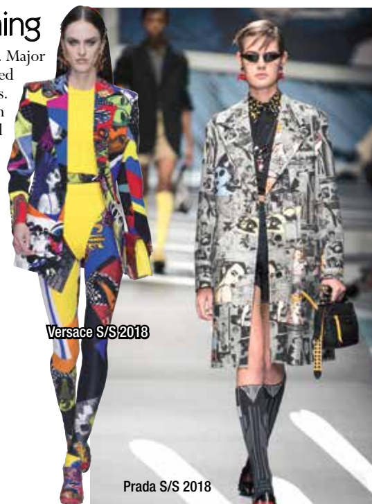
Versace S/S 2018

Life imitates art in this upcoming trend. Major fashion powerhouses included art infused prints in their S/S 2018 runway shows. Their widespread prevalence in fashion shows makes us believe that this trend will be rocked by many celebrities and online influencers come 2018.