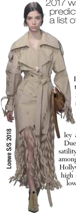
Loewe S/S 2018

2017 was a year full of shocking surprises and jaw-dropping headlines that most people would not have predicted. We bet that 2018 will be full of surprising revelations as well, which is why we've put together a list of predictions that we think the new year will bring in the worlds of entertainment, fashion, lifestyle, pop-culture and more... Let's see if we'll get them right!