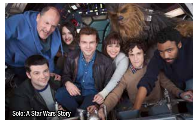
Solo: A Star Wars Story

There's more to this royal wedding than glamour. Markle is a biracial, American, divorcee who is still currently an actress, and all of this makes us love her so much more. She is not only loveable, intellectual, relatable and well spoken, she represents great strides for the palace and reminds us of the late 'People's Princess,' Diana. We're so glad we lived to see the day Prince Harry announced the girl of his dreams to the world in spite of all the odds!