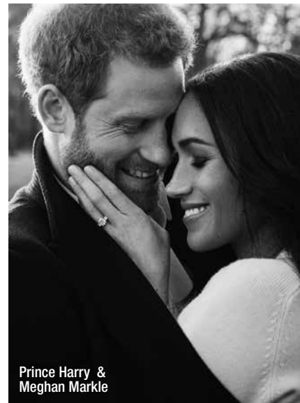
Prince Harry & Meghan Markle

The world's current favourite couple, Prince Harry and Meghan Markle, are preparing to get hitched and planning for their upcoming May wedding. Get ready and get excited to watch the latest royal wedding live and witness a real life fairy tale on your screen. Also, keep your eyes peeled for some celebrity friends of Markle's to pop up at the venue.